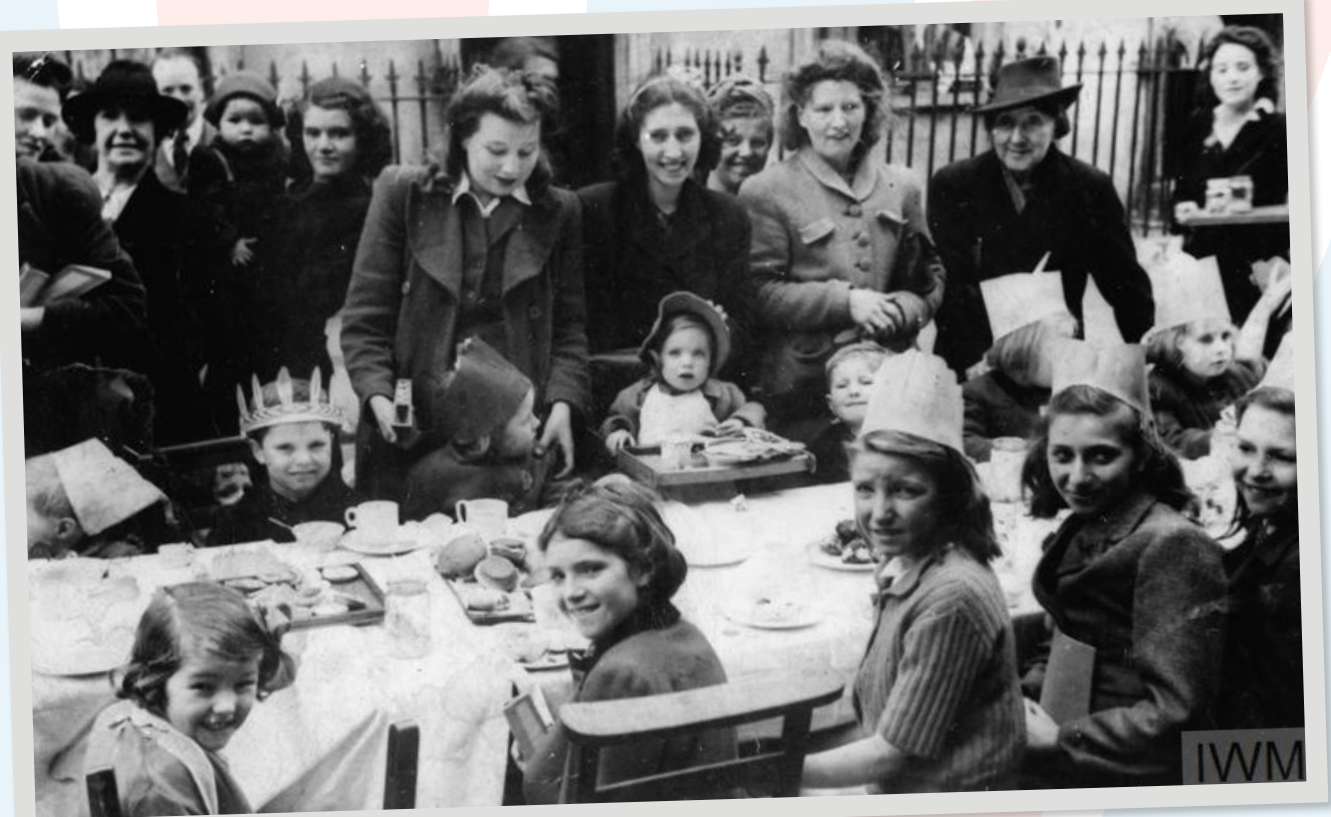
Women and children at a VE-Day street party in Stanhope Street, London NW1. © IWM (HU 92607)