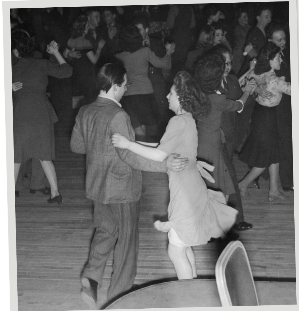
A couple at a British dance hall try out the new 'jive' steps, 1945.