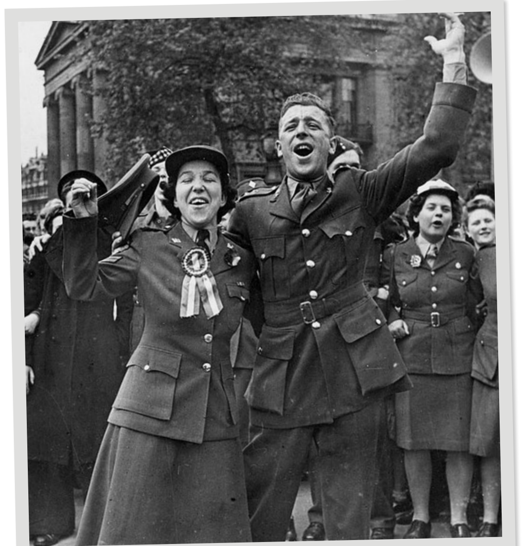
Canadian Women's Army Corps, World War 2, celebrating VE Day in London.