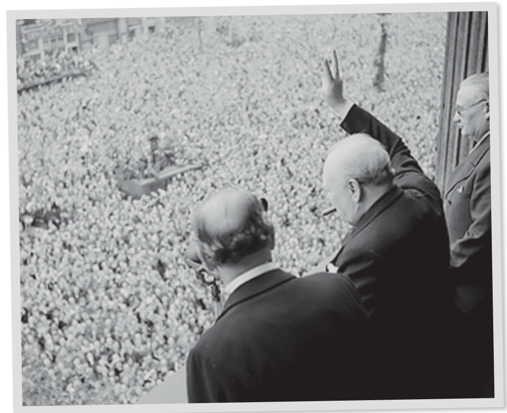
Winston Churchill Waves to Crowd After V-E Day, End of War in Europe.

After years of wartime restrictions and dangers – from food and clothes rationing to blackouts and bombing raids – it was understandable how eager they were to finally be able to let loose and enjoy themselves. Colourful bunting and flags soon lined the streets of villages, towns and cities across Britain.