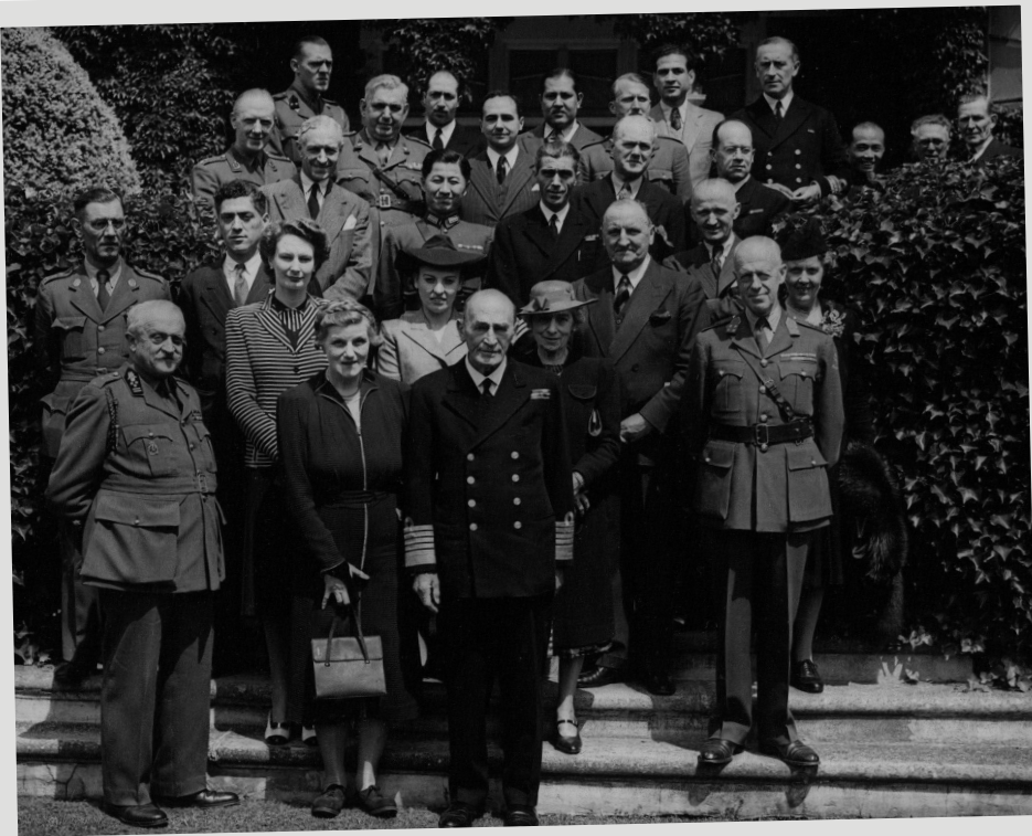
Allied representatives visit Combat Stress (then known as the Ex-Services Welfare Society), in Leatherhead, Surrey 1940s.

We hope that this gives you something fun and interactive to get going with, and that you have a wonderful celebration. Good luck and have fun!