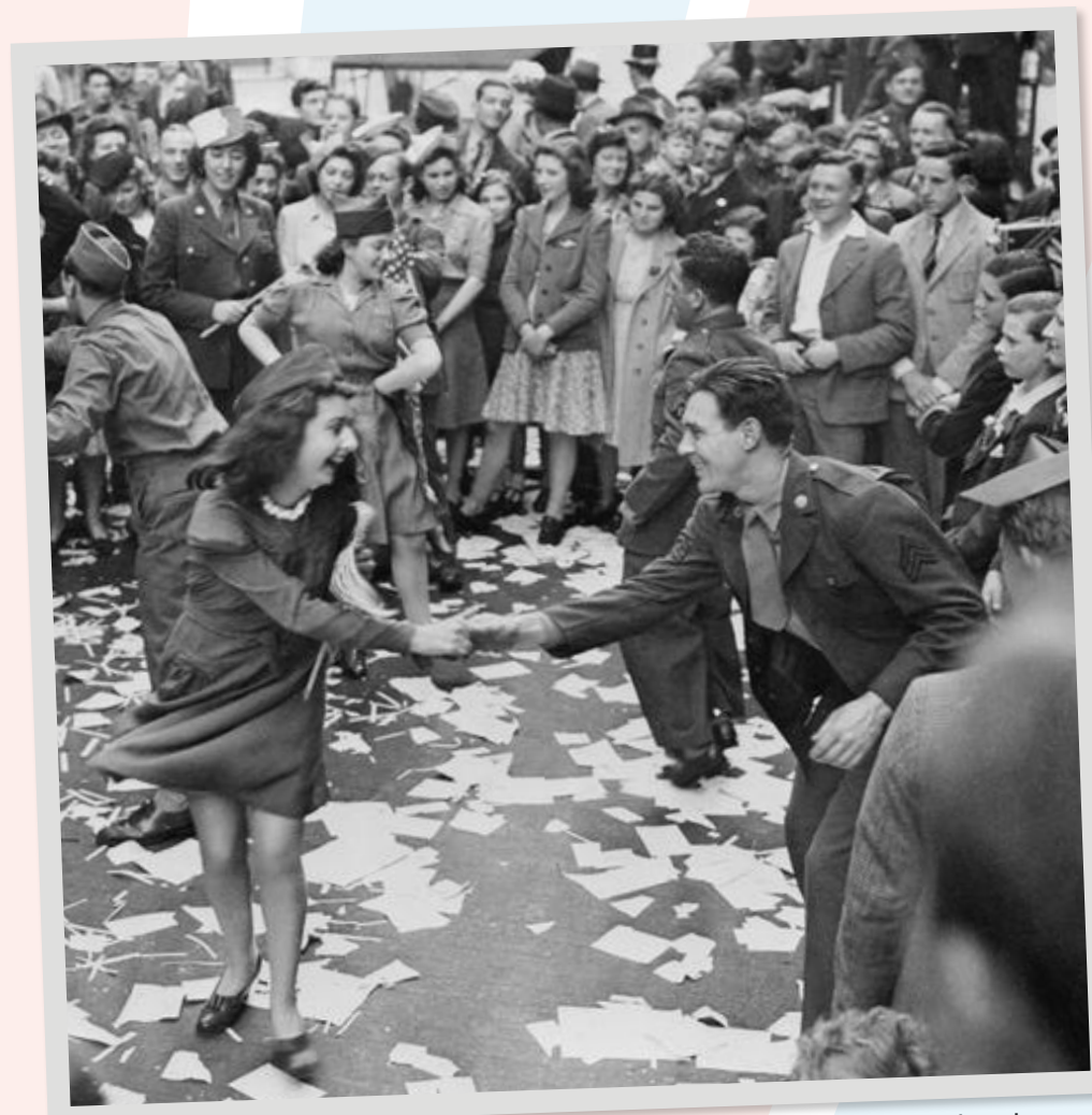
British girls, of the Picture Division of the London Office of War Information dance in the street with American soldiers during the "VE Day" celebration in London May 8, 1945.