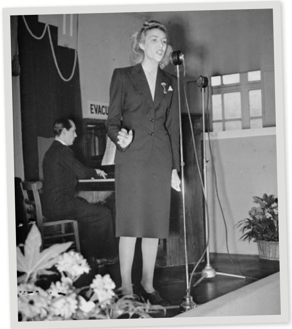
Vera Lynn visits a Munitions Factory, UK, 1941.

Vera Lynn (pictured right) was a singer during the Second World War. She was known as “the Forces Sweetheart”, often giving outdoor concerts for the troops.