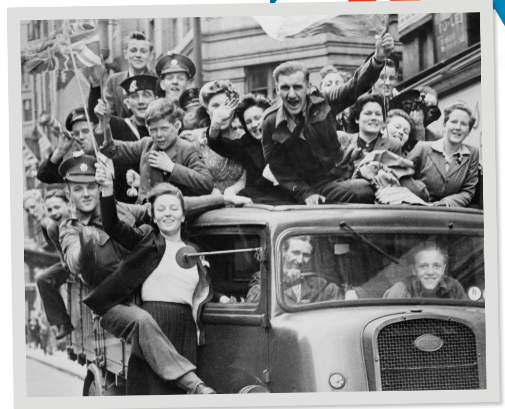
VE Day Celebrations in London, 8 May 1945.

Best of all, the money raised will help us support former servicemen and women deal with issues like post-traumatic stress disorder (PTSD), anxiety and depression. Now more than ever veterans need us and we need you – thank you.